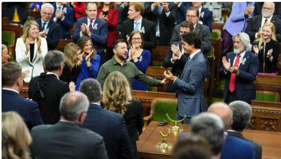
Ukrainian President Vladimir Zelenskyy (C) and Canadian Prime Minister Justin Trudeau (C, R) in the House of Commons in Ottawa on September 22, 2023

The stomach-churning scene of the Canadian parliament giving a standing ovation three days ago to a former