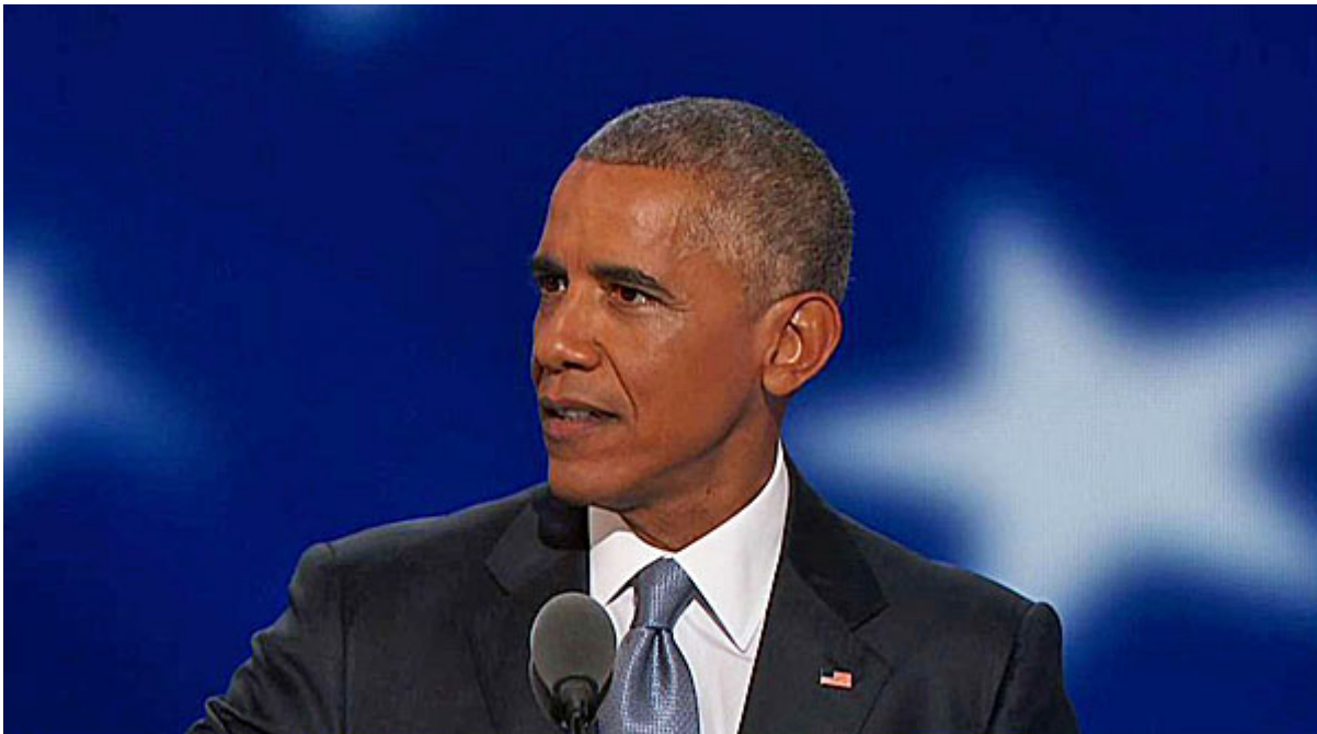
Barack Obama addresses the Democratic National Convention in Philadelphia, July 27, 2016.

Former President Barack Obama dropped a political bombshell about coronavirus on Tuesday, claiming the global pandemic a result of denials about so-called man-made climate change.