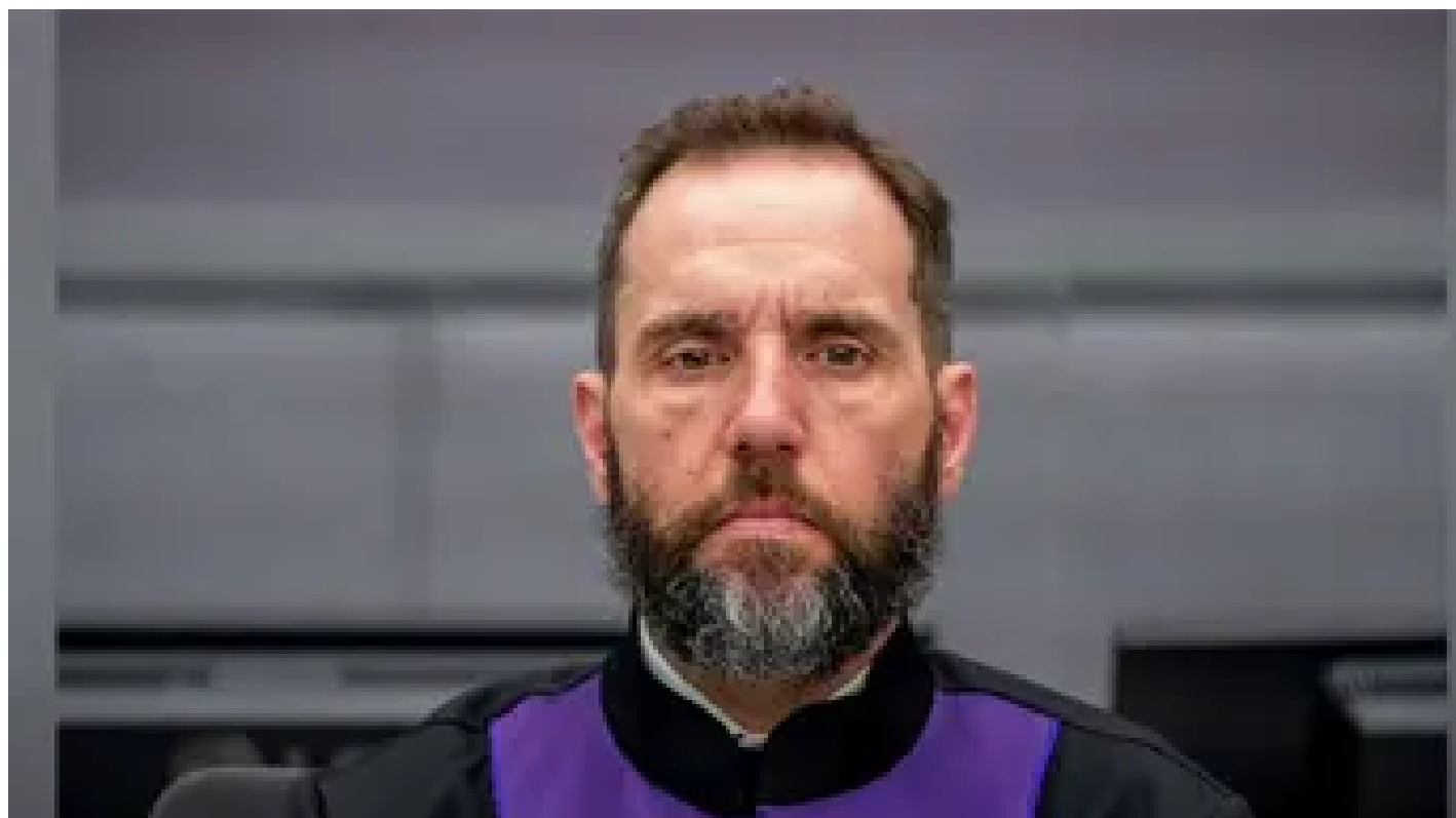
Special Counsel Jack Smith.

Shifting back to Special Counsel Jack Smith, Trump called him a "thug."