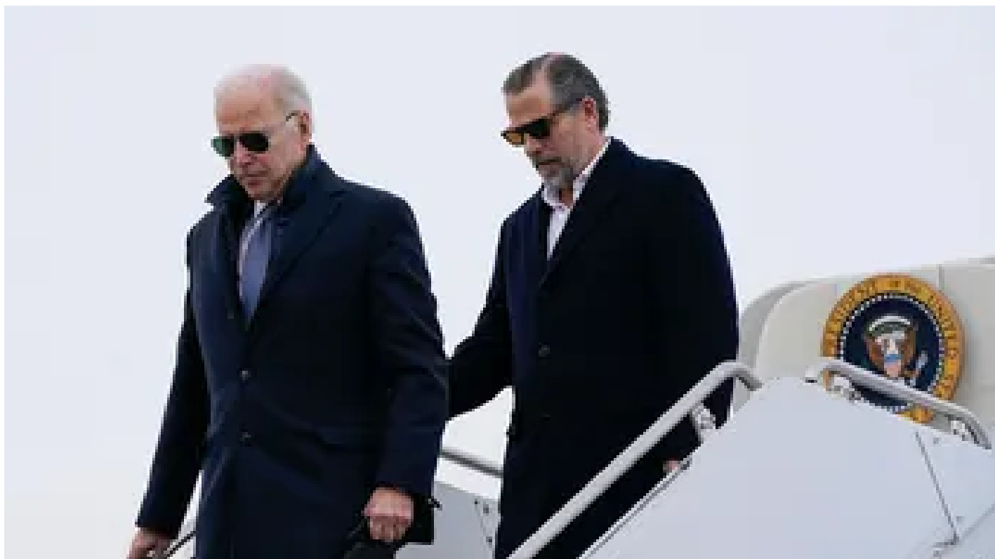
President Biden and his son, Hunter Biden, step off Air Force One, Saturday, Feb. 4, 2023, at Hancock Field Air National Guard Base in Syracuse, New York.

If re-elected in 2024, Trump said he would appoint a special prosecutor "to go after the most corrupt president in the history of the United States of America," referring to Joe Biden and "the entire Biden crime family."